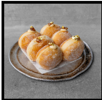
CHESTNUT AND VANILLA DOUGHNUT $6/PIECE

A Christmas tradition containing black raisins, candied lemon and orange, soaked in Drambuie.