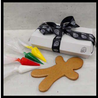
XXL GINGERBREAD MAN DIY KIT $20

Each Gingerbread Man DIY Kit contains 1 XXL ready-to-eat Gingerbread Man and Decorative Frosting.