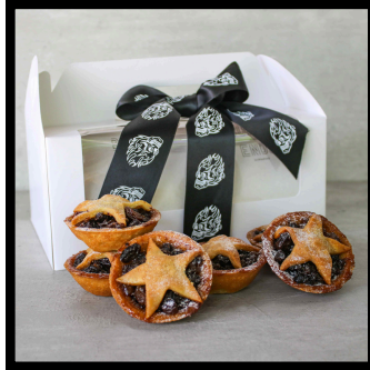
MINCED PIES $30 FOR A BOX OF 6 PIECES

Each Gingerbread Man DIY Kit contains 1 XXL ready-to-eat Gingerbread Man and Decorative Frosting.